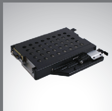
Multimedia Bay 2 nd Storage