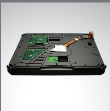
PCI / PCI-Express 3.0 Expansion Unit