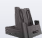
94A150095 Single Slot Charging Dock