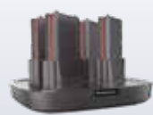
94ACC0192 4-slot Battery Charging Dock