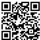
ZX10 3D demo