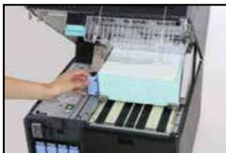
Easy label media replacement