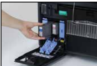
Simple ink cartridge replacement

*Specifications subject to change without notice.