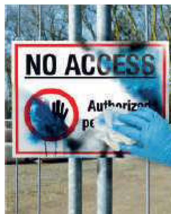
Image description: A sign printed with the MultiMax 5 PCi and MAX Guard can be easily cleaned with solvent without being damaged.

With the MAX Guard ink technology in the MultiMax 5 PCi, the prints get extra protection without any additional work steps. The MultiMax 5 PCi mixes MAX Guard with the ink for high durability. Post-treatment, e. g. laminating, is not required.