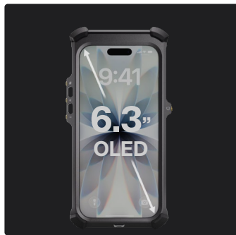
Ultra bright & responsive display