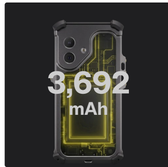
All-day battery life