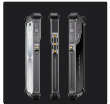
Lightest & slimmest