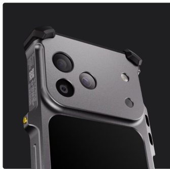
Pro camera with LiDAR scanner