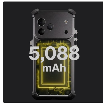
All-day battery life