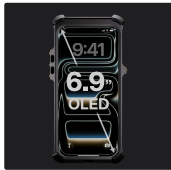
Ultra bright & responsive display