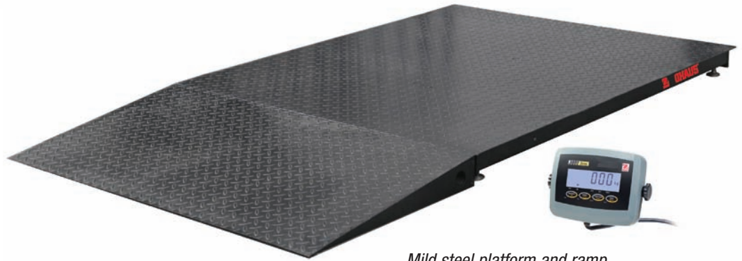
Mild steel platform and ramp shown with T31P indicator