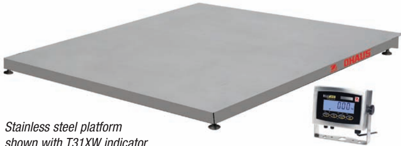
Stainless steel platform shown with T31XW indicator